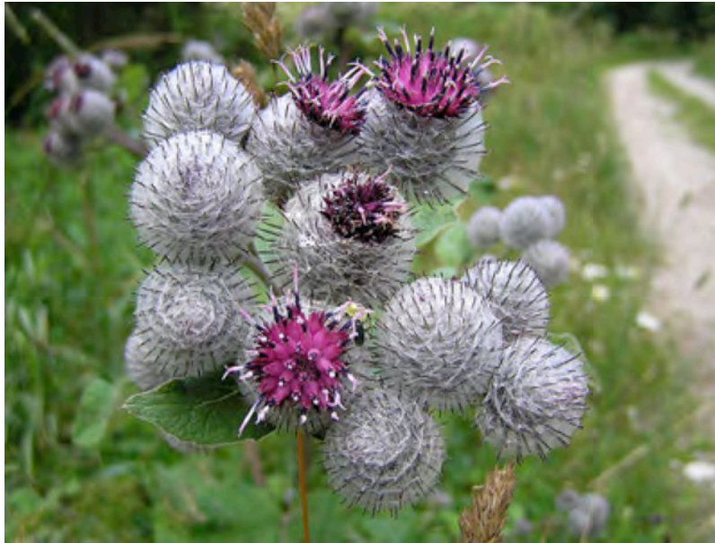
Burdock, Photo by Epukas